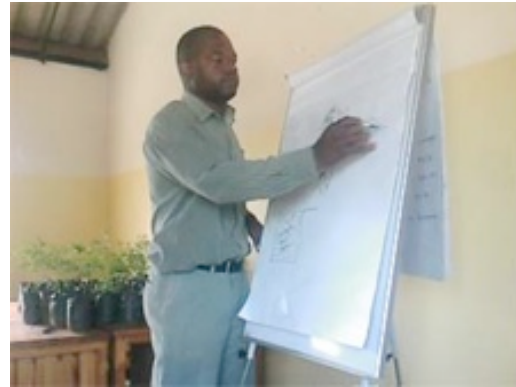
Participants paying attention to facilitator during training