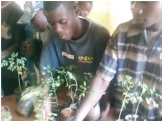
Boys preparing to plant the seedlings

The boys were educated on the various uses of the Moringa tree, which is also known as the “miracle” tree. It is referred to the miracle tree due to its high nutritional and medicinal value content.